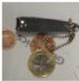
This is a nailcutter. I use it in _____.

Name the things you use to clean yourself.