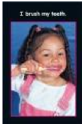
I brush my teeth